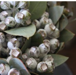
luxury spa energizing 0.3 fl oz / 10ml

Clean and purify the air and lift your spirits with the uncomplicated aroma of this sparkling citrus blend. Refreshing and crisp like the air after a sun shower, this scent will have your soul singing.