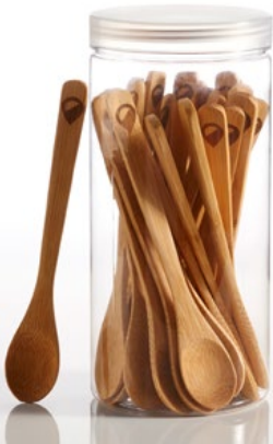
6" Bamboo Spoon