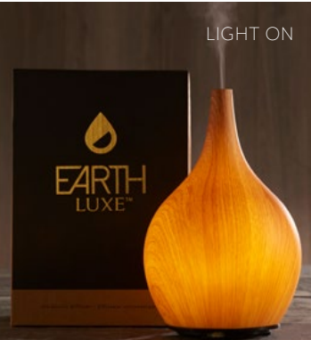
Faux Wood 8.5" tall / Tank 2oz One Color Light