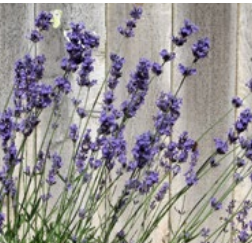
forest path uplifting 0.3 fl oz / 10ml

Breathe deeply to experience the fresh aroma of this uplifting and energizing combination. Slightly minty, with lavender notes, this scent stimulates the mind, restores focus and enhances breathing.