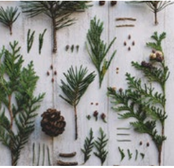
mountain air calming 0.3 fl oz / 10ml

Breathe deeply to experience the fresh aroma of this uplifting and energizing combination. Slightly minty, with lavender notes, this scent stimulates the mind, restores focus and enhances breathing.