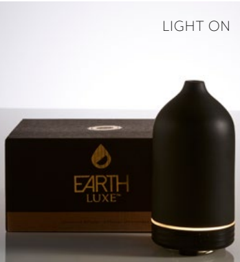
Black Ceramic 8" Tall / Tank 4 oz One Color Light