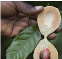
moroccan spice Invigorating 0.3 fl oz / 10ml

Experience the wonder of evergreen forest freshness in this crisp blend of essential oils. Woodsy with just the right note of citrus makes this blend purifying, uplifting and irresistible.