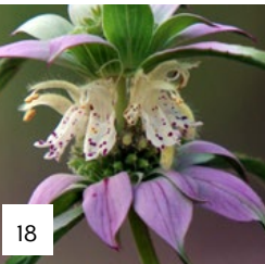
shangri-la relaxing 0.3 fl oz / 10ml

Enjoy a luxurious escape to clear and energize your mind with this zesty citrus blend of essential oils. It's slightly sweet aroma and clean scent will create a spa-like experience in your own home.