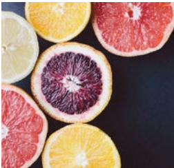
citrus blossom refreshing 0.3 fl oz / 10ml

Clean and purify the air and lift your spirits with the uncomplicated aroma of this sparkling citrus blend. Refreshing and crisp like the air after a sun shower, this scent will have your soul singing.