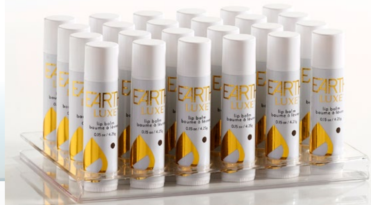
Coconut Oil & Beeswax Lip Maintenance Stick