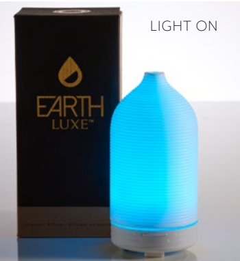
White 8" Tall / Tank 4 oz Multi Color Light