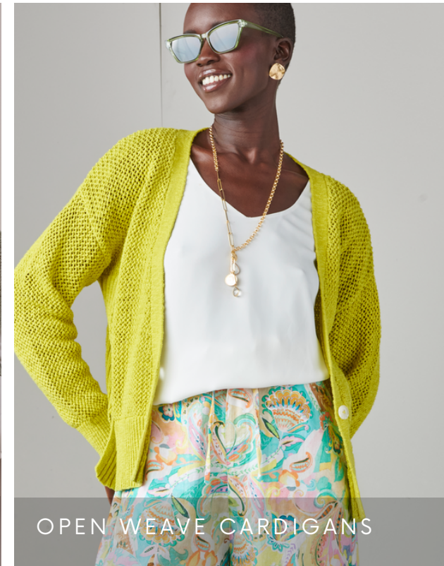
OPEN WEAVE CARDIGANS