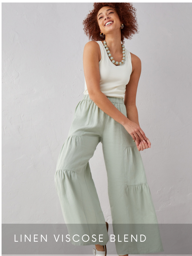
LINEN VISCOSE BLEND