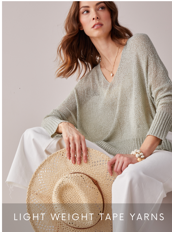
LIGHT WEIGHT TAPE YARNS