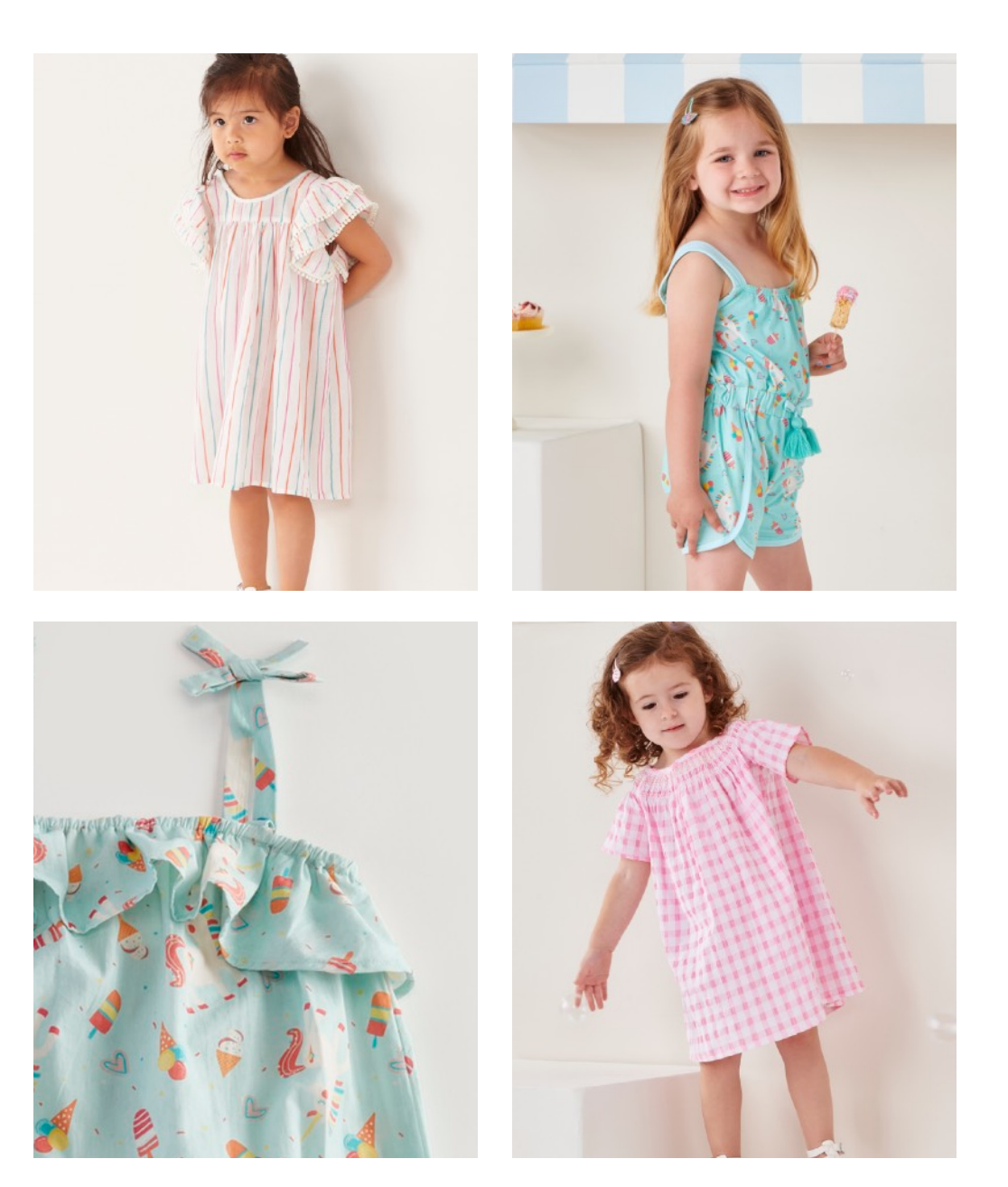
Multicolour stripes, and soft cotton seersucker checks create texture and interest.