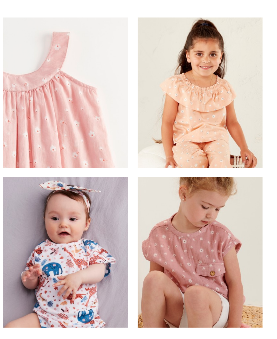
Dusty pinks and warm corals feel nourishing and calm. Delicate cotton textures, and wood buttons feel close to nature and organic.